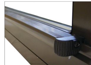
Continuous Anti-Drift Clip