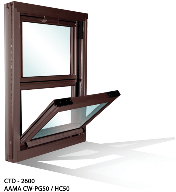
CTD - 2600 AAMA CW-PG50 / HC50 IGCC-CBA