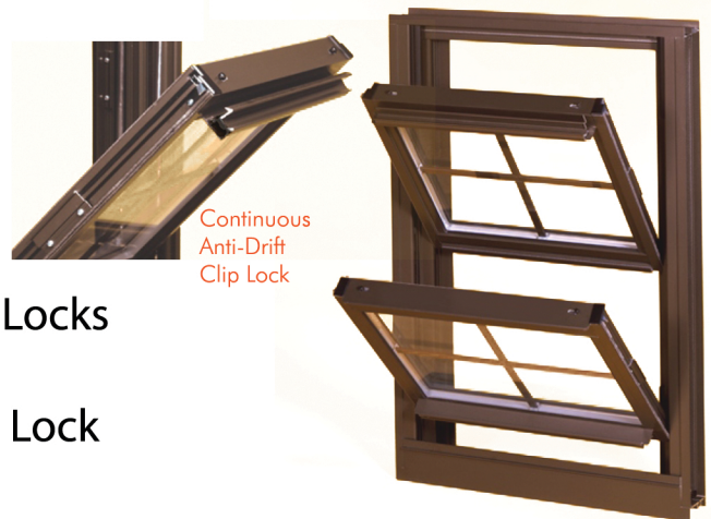
Continuous Anti-Drift Clip Lock

The CTD 5500 is a HC rated aluminum double-hung window with a 3¼" jamb depth. Loaded with features, like the continuous anti-draft clip locks, the window is a proven performer.