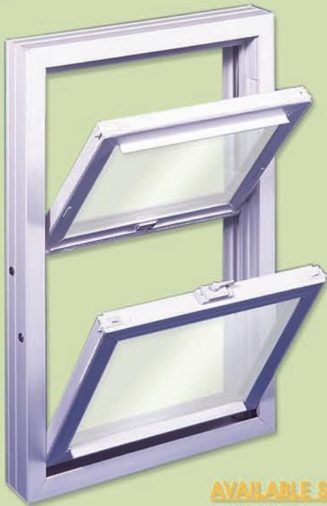
AVAILABLE STYLE: DOUBLE HUNG