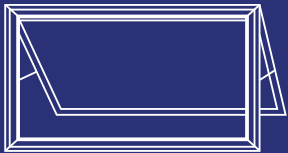
Series 245 Awning Windows