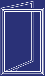
Series 235 Casement Windows