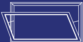
Series 255 Hopper Windows