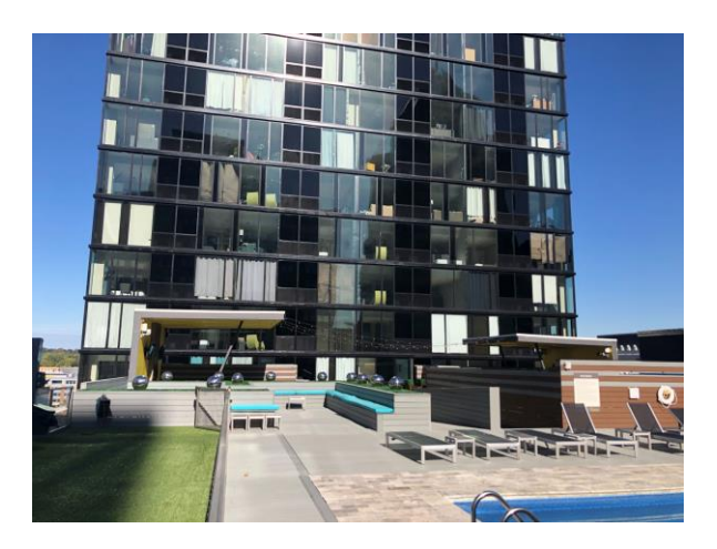
Custom Window Wall System with 1,161 Fixed Windows