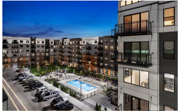
Narrow sightlines, two-tone windows and doors provide expansive views and style