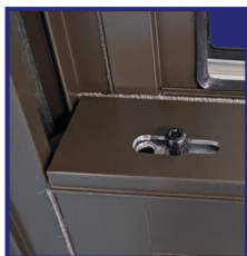
Weather Stripping w/ Recessed Tilt Latch