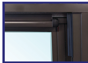
Full Width Anti-Drift Clip Lock