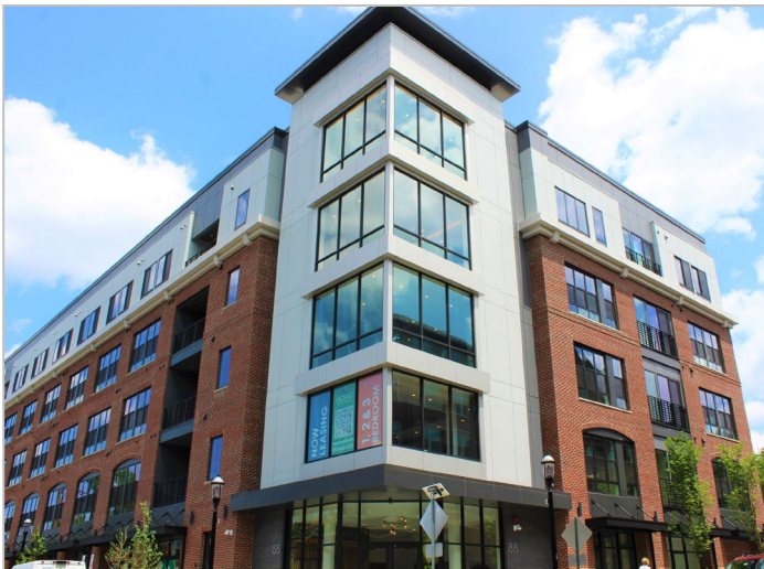
Crystal Windows supplied 8 different commercial aluminum window and door lines for the new luxury development The Mosaic in South Orange, NJ, providing expansive views and great energy efficiency.

QUEENS, NY, March 10, 2026 – The Mosaic, a new upscale boutique multifamily development, tapped Crystal Window & Door Systems’ products to bring elegance, style, and class to the project. The national award-winning manufacturer furnished the new development with 323 quality energy efficient large windows and doors. The Mosaic is a modern design 5-story brickface and EIFS panel façade structure located at 88 Sloan Street, between Second and Third Streets in South Orange, NJ. Across the street from the NJ Transit South Orange rail station and within the designated South Orange Transit Village, the new luxury apartment building is part of the ongoing redevelopment and rejuvenation of this community.