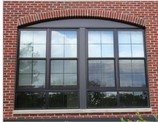
Crystal windows with narrow sightlines and great strength offer residents of The Mosaic abundant daylight, multiple styles and functions, and effective sound attenuation, important due to the proximity of the property to the South Orange NJ Transit rail station.

Complementing the sliding and double-hung windows on this project were the Crystal Series 2100 fixed windows, also a 3-¼” frame depth product which is rated CW-PG60. A master frame sash impost option makes two- and three-lite horizontal and vertical arrangements possible. On The Mosaic building, the Series 2100 fixed windows included matching decorative between glass grids when paired with the Series 2600 double-hung windows.