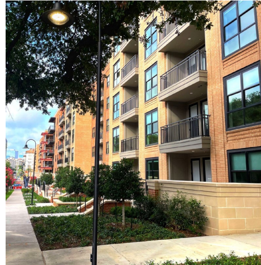
Crystal Windows provided over 700 commercial aluminum windows for the new luxury development The Park at Katy Trail in Dallas, TX. The Crystal top selling Series 2000A double-hung and Series 2100 fixed windows, arranged in multiple combinations, provide expansive views, exceptional energy efficiency, and excellent sound attenuation for superior comfort for residents.

“Our commercial aluminum windows are increasingly popular in Dallas and other growing markets for their versatility, functionality, and many custom design possibilities,” said Frank Ganninger, Regional Sales Manager. “In addition to our broad product line, we offer architects, developers, and general contractors design and value engineering services that help make their projects come to life.”